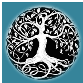
Women's Congress for Future Generations